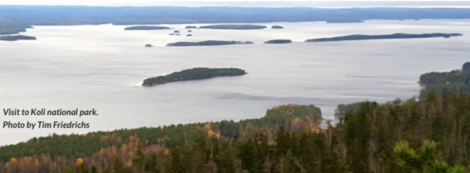
Visit to Koli national park.

Funded by the European Social Fund and Ministry for Social Affairs and Employment of Germany, the project includes two annual flows: one to Finland, and one - to Italy.